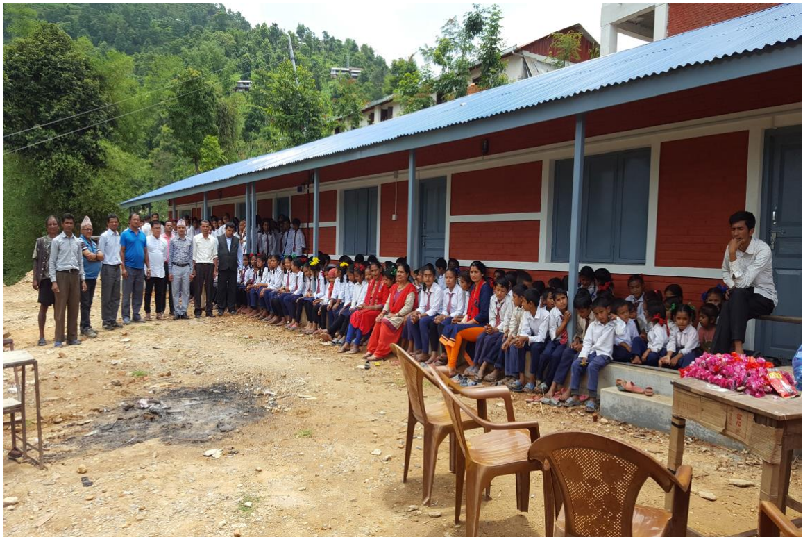
Glimpse of School Family