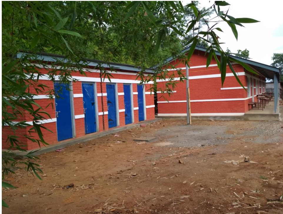
Completed School Building & Toilet Block