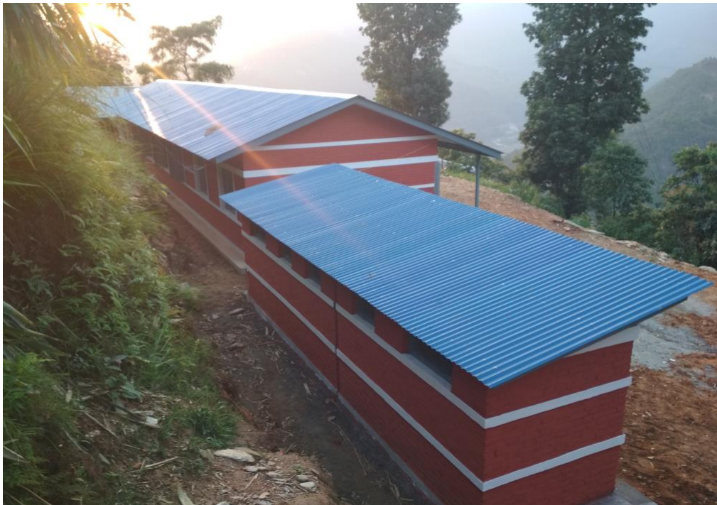
Back view of Toilet & School Block